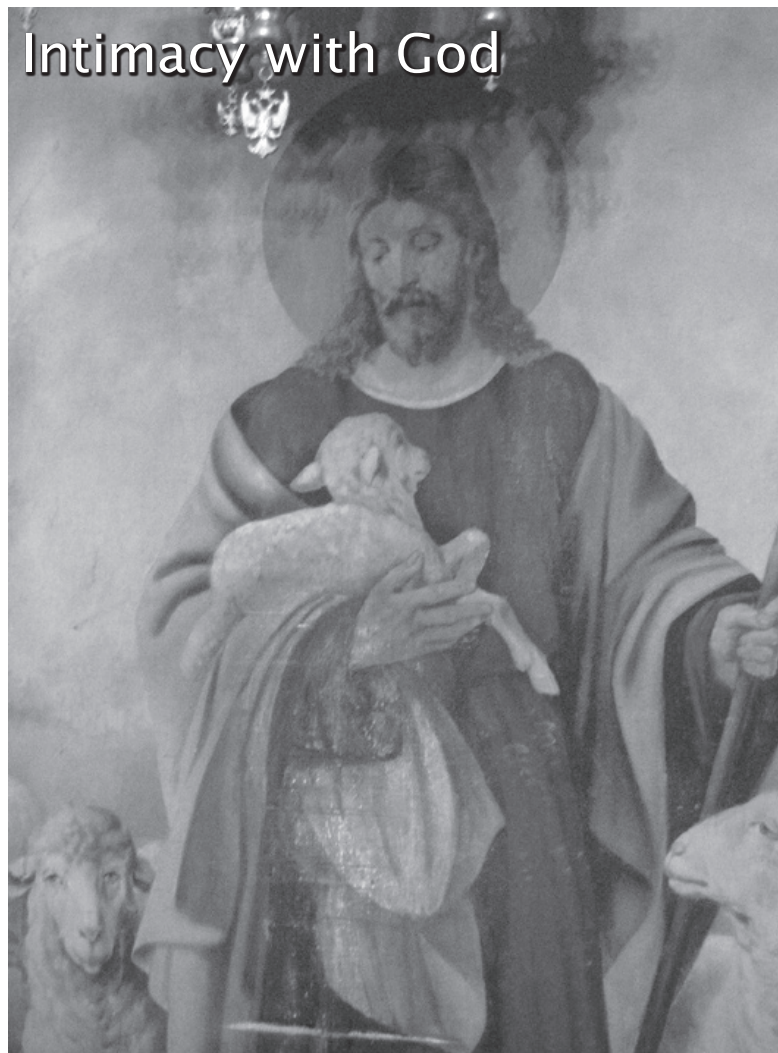
From inside St. Michael's Shrine, Tarpon Springs, FL. It is unique in that Jesus and the lamb are looking at each other.

In my 20+ years of offering spiritual direction to men and women, clergy and laity, I have noticed that those who have intimate encounters with God are more in touch with our Triune God as Jesus the Christ . Experiencing God as Father, God as Spirit and even God as Mother all resonate and have been of tremendous value in my own life, so I'm not saying that way is less true somehow.